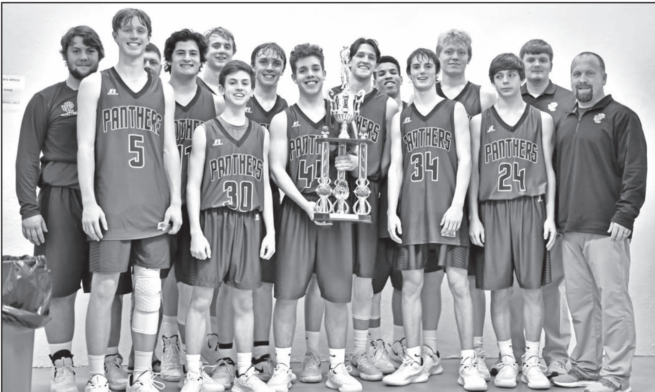
Union County placed third at the 25th Annual Battle of the States Christmas Tournament following two wins in three days.

The Panthers maintained the 20-point lead until the final 70 seconds of the quarter when the never-say-die Wildcats used a 7-0 run to make it a 49-34 game to